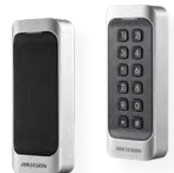
Electronic Access Control