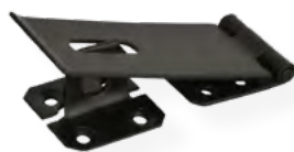
Hasp & Staple Lock