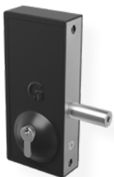
Lock & Key