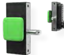
Swing Gate Mechanical Lock