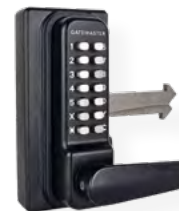
Sliding Gate Code Lock