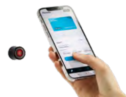
Ojmar OCS Pulse