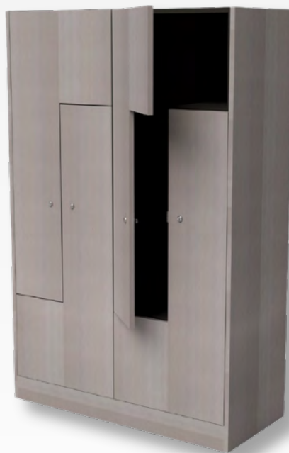
Z doors are an optional configuration, not standard