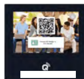
Central Managed RFID Solutions