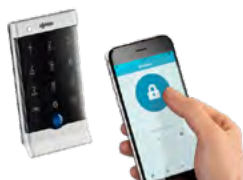
Ojmar OCS Smart Phone Lock