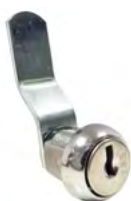
Key Cam Lock