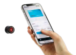
Ojmar OCS Pulse