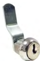
Key Cam Lock