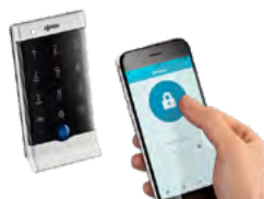
Ojmar OCS Smart Phone Lock