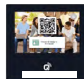
Central Managed RFID Solutions